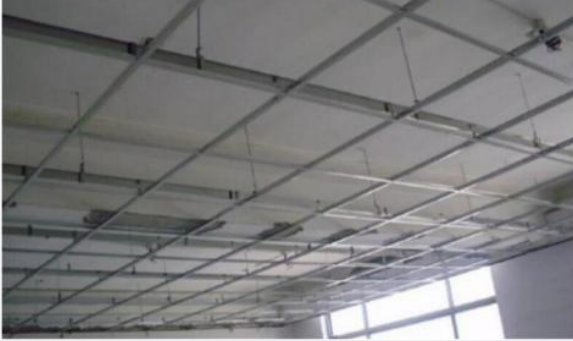
Ceiling Steel Frame