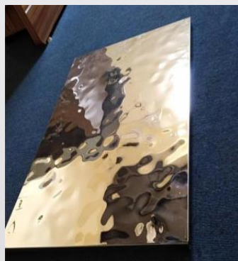
Panel front side