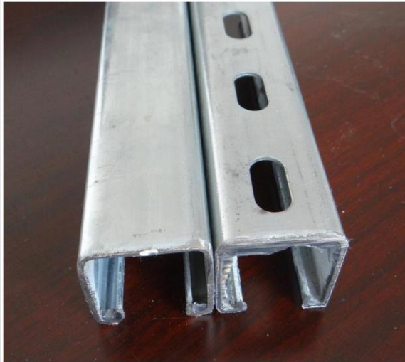
Holes on the channel