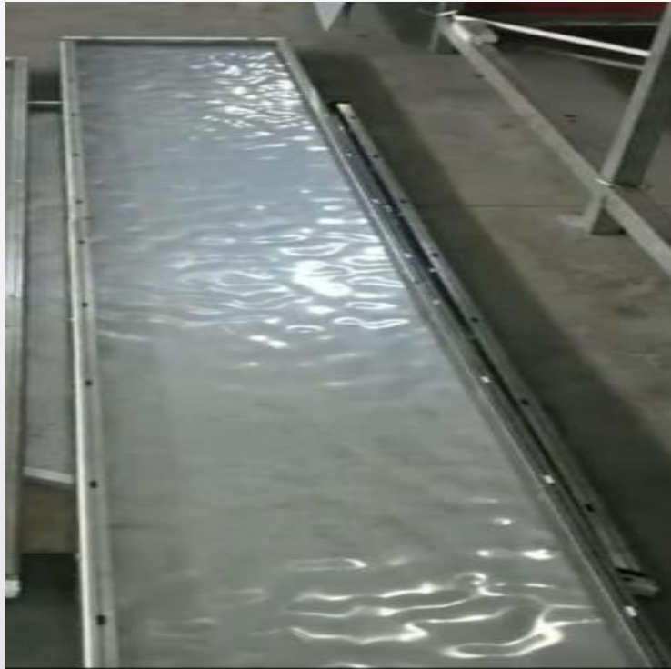
Make holes on back side