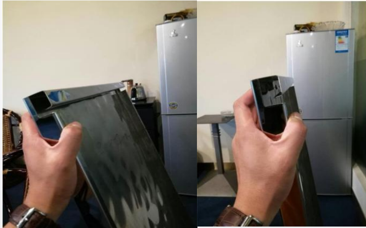
Bent edges for panel